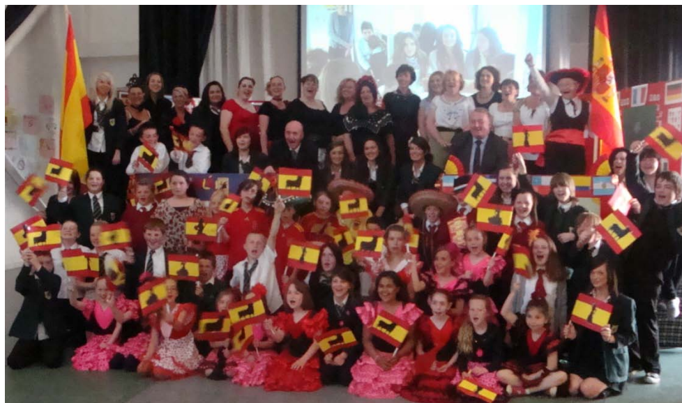
JOHS pupils, primary pupils, teachers and catering staff celebrate John Ogilvie's Spanish Day on Wed 16 th June.

John Ogilvie High School has been named as the only Scottish School to be awarded the title of Spanish School of the Year 2010 by the Spanish Embassy in London.