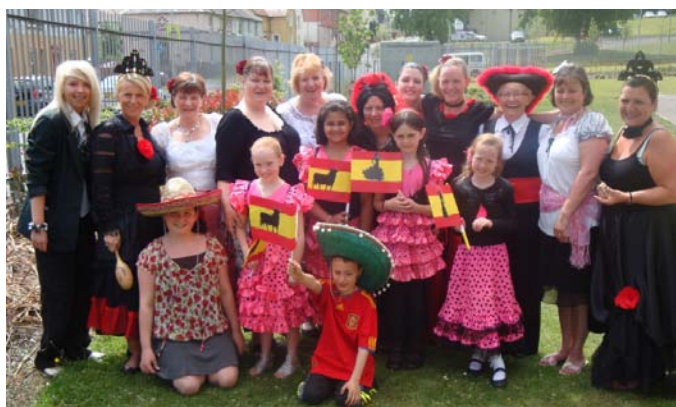
Catering staff, Active Break workers and Primary Pupils celebrate the school's Spanish Day.

I believe some of the costumes on display will be a joy to behold!" (see left)