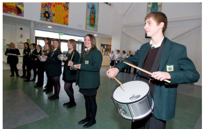
Samba Band kicks off the Event accompanied by our African Dancers