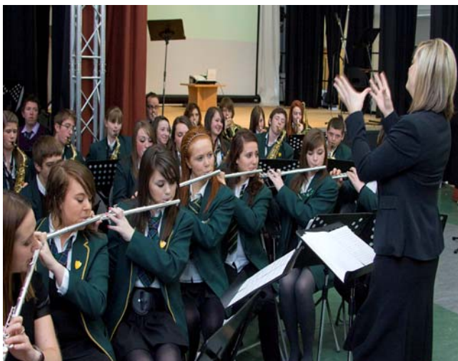
Senior Band play a medley of tunes from the 80s.