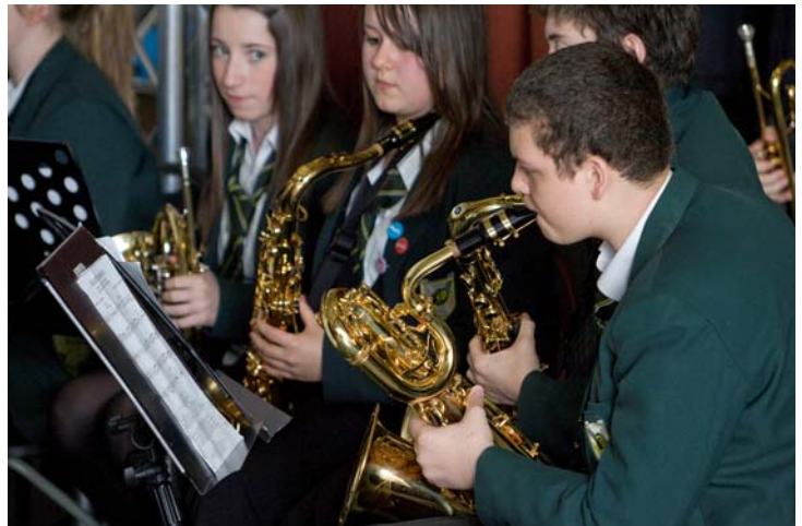
Senior Band play a medley of tunes from the 80s.